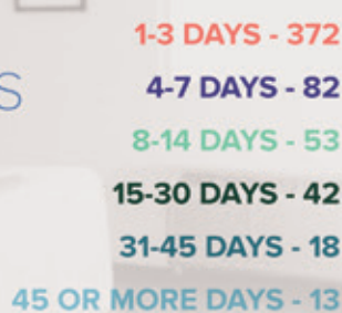
HOW LONG THEY STAY